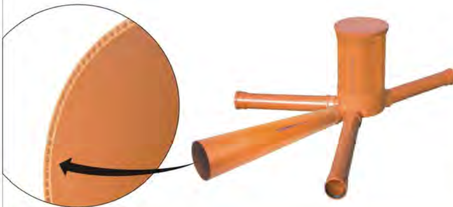
Dimensions and Stiffness class of Eco-drain pipes

These pipes are interchangeable with solid wall pipes and are compatible with regular PVC fittings.